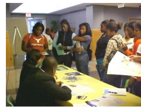
Johns Hopkins University School of Medicine