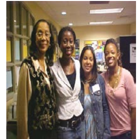
Spelman Health Careers Program Alumnae returned to visit during the 2007 Homecoming Weekend

“Life’s most persistent and urgent question is: What are you doing for others?” by Dr. Martin Luther King, Jr.