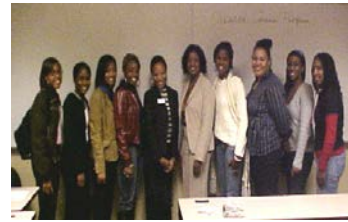
University of Georgia College of Pharmacy