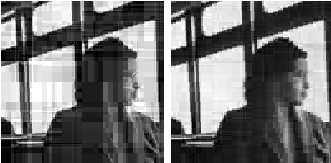
Figure 5: 10:1 compressions of the Rosa Parks image

Now we consider more realistic, larger image matrices, such as the one in Figure 2(a). Let's take \epsilon = 200 . We process the entire 128 \times 128 matrix, which involves 7 rounds of row averaging and differencing followed by 7 rounds of column averaging and differencing, and then set to zero all entries which do not exceed 200 in absolute value. Finally we apply the inverse wavelet transform. We obtain the rather poor compressed image shown in Figure 5(a), and a compression ratio of 10:1.