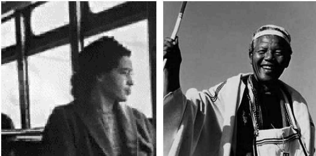
Figure 2: Rosa Parks (1955) and Nelson Mandela (1990)

Each matrix entry gives rise to a small square which is shaded a constant gray level according to its numerical value. We refer to these little squares as pixels ; they are more noticeable as individual squares when we view the images on a larger scale, such as in Figure 2(a). Given enough of them on a given region of paper, as in the 256 \times 256 pixel 8-bit image of Nelson Mandela in Figure 2(b), we experience the illusion of a continuously shaded photograph.