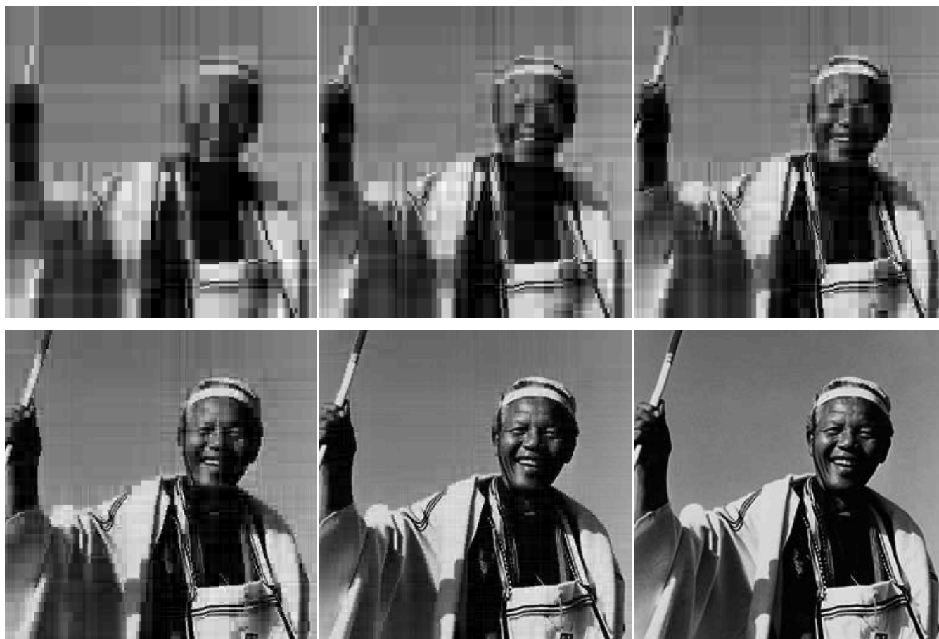
Figure 7: The ever progressive Nelson Mandela

For instance, the images of Rosa Parks in Figure 1, which use normalized wavelet compression with ratios of 50:1, 20:1, 10:1, and 1:1 (i.e., the original), respectively, could form stages in a progressive transmission, finishing up with a perfect image. Figure 7 shows another example using the Nelson Mandela image. Again, normalized wavelet compression is used here, this time with ratios of 200:1, 100:1, 50:1, 25:1, 10:1, and 2:1 respectively. The “half Nelson” in the last image is such a good approximation that it’s almost indistinguishable from the “whole Nelson” in Figure 2(b).