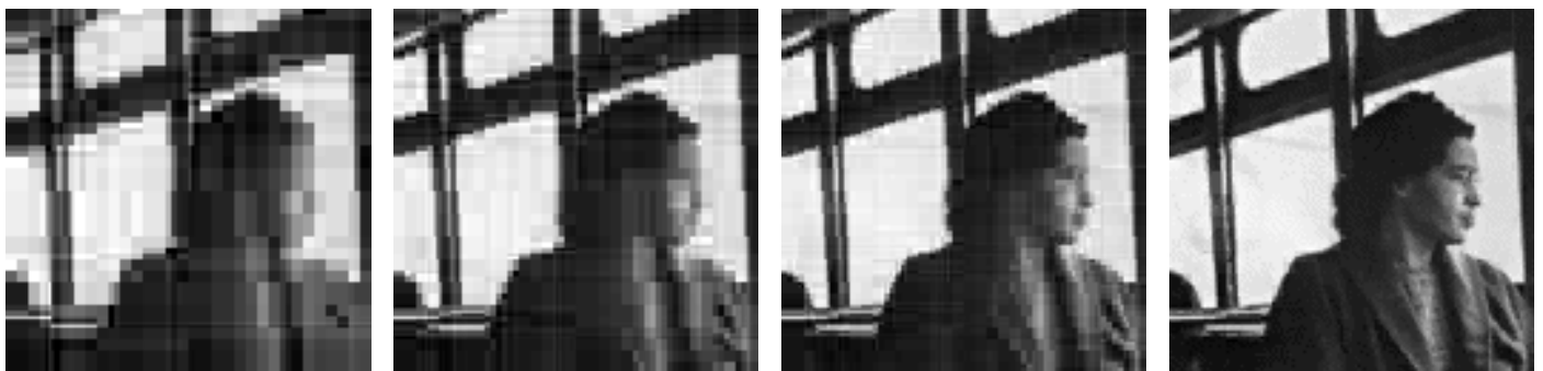
Figure 1: Person in bus

What these examples all have in common is information transmission at various levels of detail . In the first example, each person received information up to, but not beyond, a certain level of detail. The second example illustrates progressive information transmission : We start with a crude approximation, and over time more and more details are added in, until finally a “full picture” emerges. Figure 1 illustrates this pictorially: looking from left to right we see progressively more recognizable images of Rosa Parks.