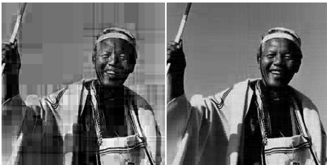
Figure 6: 10:1 compressions of Nelson Mandela image

The averaging and differencing which is at the heart of the wavelet transform earlier involves repeated processing of certain pairs (a, b) to yield new pairs (\frac{a+b}{2}, \frac{a-b}{2}) . In the normalized wavelet transform , we process each such pair (a, b) to yield (\frac{a+b}{\sqrt{2}}, \frac{a-b}{\sqrt{2}}) instead. Until we get to §5, this new form of averaging and differencing will likely seem unintuitive and unmotivated. Certainly, we have a reversible transform. We do not inflict any explicit examples of normalized wavelet transformed strings or matrices on the reader, but content ourselves with exhibiting the resulting compressed images. For a given compression ratio, normalization generally leads to better approximations, as we just saw in Figure 5(b).