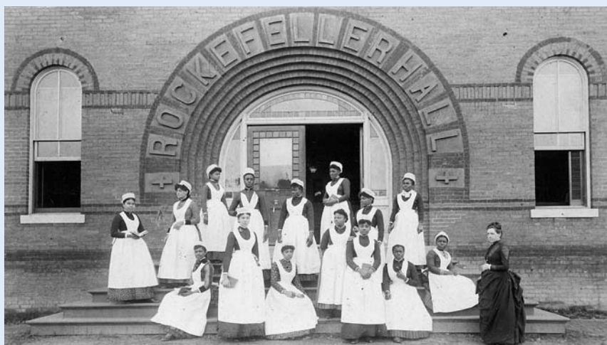
1886 Nurses Training Class