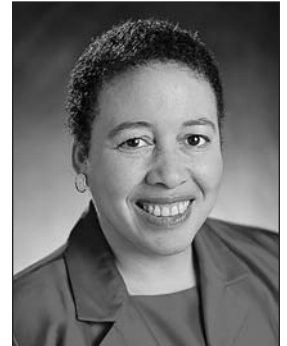
Dr. Beverly Daniel Tatum

As we celebrate our successes, the drought conditions in the Southeast and the climate changes around the globe remind us of the urgency of our actions. We know that there is more work for us to do in this arena. We want Spelman College to be strong and vital far into the future, but it won't matter if the world we live in has become uninhabitable. Let us be consistent in our actions, consistent in our values, consistent in our efforts to preserve the environment. Together we can make a "green" choice—a choice to change the world... for the better. ●