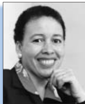
Dr. Beverly Daniel Tatum

Spelman has a solid foundation, and we want to build on it, not rest on it. I look forward to your support in making Spelman College “nothing less than the best.” ●