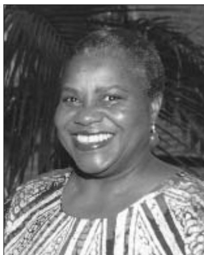
Professor Bernice Johnson Reagon